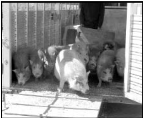
First Group to Arrive